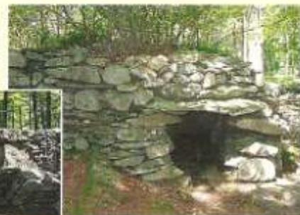
Above: South Facing Chamber. The entrance of this chamber is oriented to the south. Restorations of the chamber took place in 1982 and 1992 due to earthquake damage.