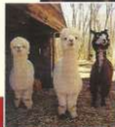
Meet our friendly alpacas in our alpaca habitat.