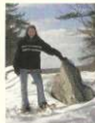
Snowshoeing past the summer solstice stone marker.

The Pope Road Nature Trail — a recreation of a native American habitat area.