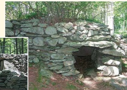
Above: South Facing Chamber. The entrance of this chamber is oriented to the south. Restorations of the chamber took place in 1982 and 1992 due to earthquake damage.