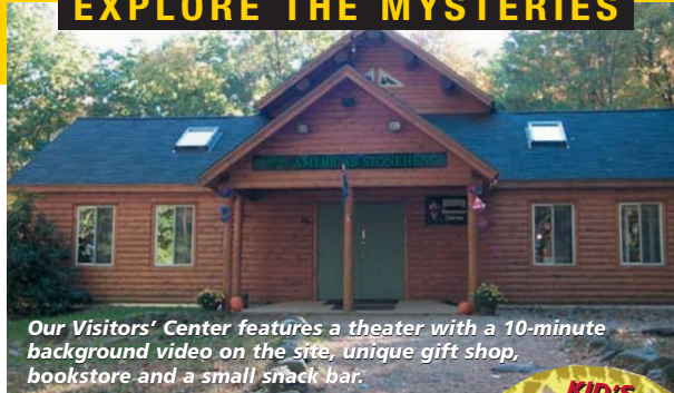
Our Visitors' Center features a theater with a 10-minute background video on the site, unique gift shop, bookstore and a small snack bar.