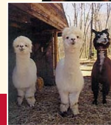
Meet our friendly alpacas in our alpaca habitat.