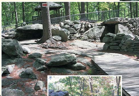
Below: Overview of the V-hut and east-west chamber — a three-sectioned chamber, similar to ancient European structures, believed to have some astronomical significance due to its orientation.