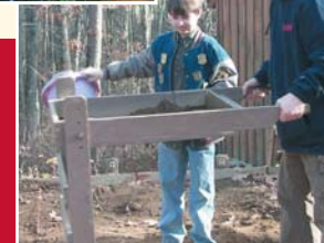
Using a "sifter" to screen for artifacts.